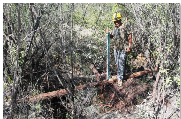
Figure 3 : Historic workings at Nosib copper-vanadium mine.